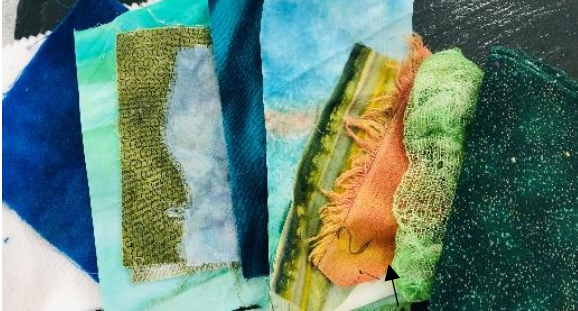
Samples shown above

Fabrics In this class we are using scraps from your scrap bag or box in a variety of colours etc.